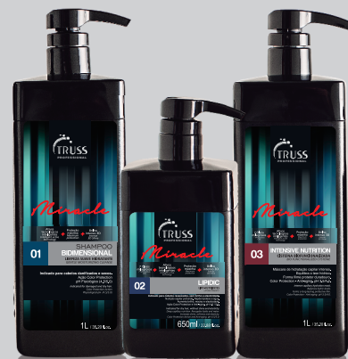
SHAMPOO BIDIMENSIONAL Gentle Moisturizing Cleanse LIPIDIC Liponutrients INTENSIVE NUTRITION Bio Functionalized Cysteine

Fast recuperation treatment with ultra-modern actives that penetrate the fiber and restore hair's natural properties.