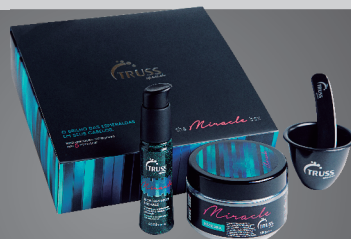
the Miracle box