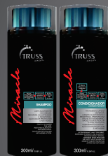
Shampoo e Conditioner