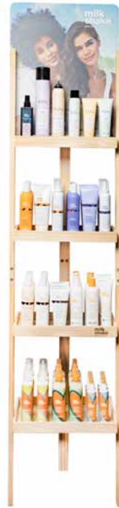
Measurements: 18"X14"X71" Natural Pine Material Lean on the wall or be free-standing