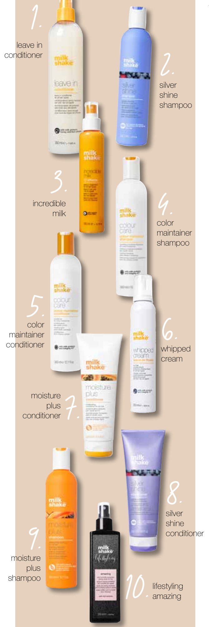
1. leave in conditioner

1 of these milk_shake favorites is sold every minute around the world